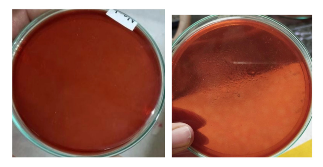
Fig. (3-a): Plate on day o

After 48 hours of incubation, one of the nutrient agar plates containing 1:2 dye concentration showed small patches of decolorization. The results of dye degradation are shown in Fig. 3(a, b). After 72 hours the patches of decolorization increased in size. After a total incubation of 5 days all the plates having both 1:2 and neat concentration of dye showed large patches of decolorization which extended all over the plates. This study thus indicates the capacity of microorganisms grown in dilute media to degrade azo dyes to an extent. Limitations of the study include recreation of the exact enrichment conditions on a large scale. Along with this development of pure cultures of the obtained isolates was difficult due to the extremely small size of the colonies.